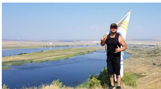
Positive Pulse White Bluffs Hike in July 2018